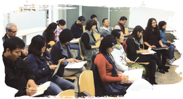
Above: Coquitlam Public Library held citizenship classes to help newcomers prepare for their Canadian citizenship test.

We provided a welcoming environment for new Canadians to improve their English and helped them in their search for skilled employment.