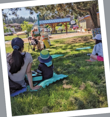
Parents and tots gather safely for Story Times at local parks.