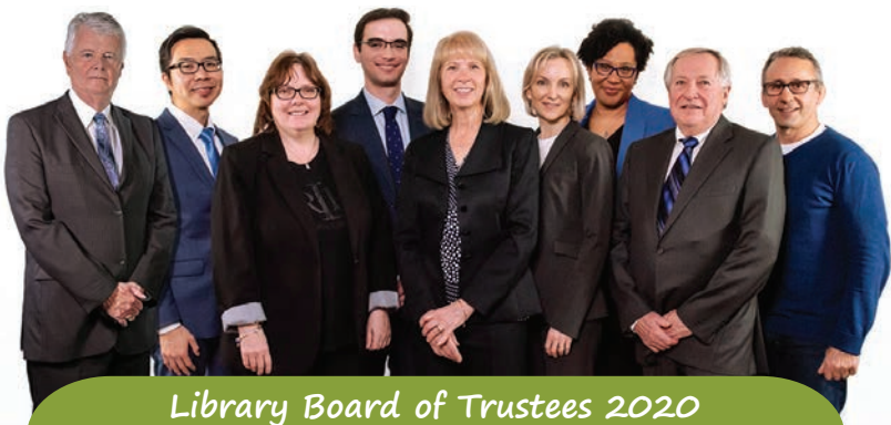
Library Board of Trustees 2020