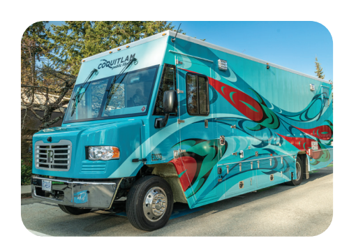
Library Link See schedule on page 11 of this guide or at coqlibrary.ca/librarylink